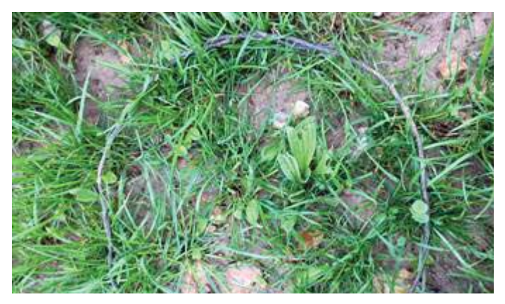
Herbal lev 2019 recovery

Herbal leys had deeper rooting systems than the grass/ clover mixtures. Worm activity was recorded as low within both mixtures.