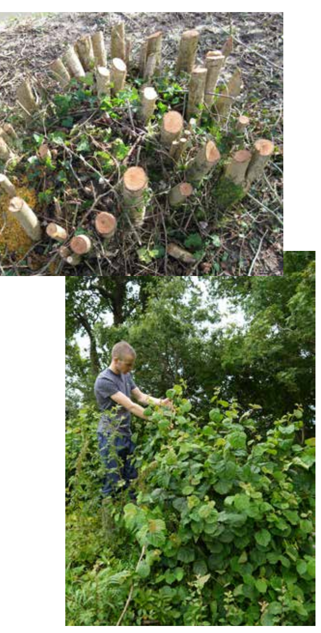
Recently coppiced hazel stool (above) and 1.1m hazel regrowth seven months later (below).

longer rotation of 20-30 years and can also be managed as standards. In summary, it is likely that you will get some regrowth from most broadleaf species, but if you have hedges which predominantly consist of species listed here as less reliable, then it is recommended that you seek further specialist advice before coppicing them.