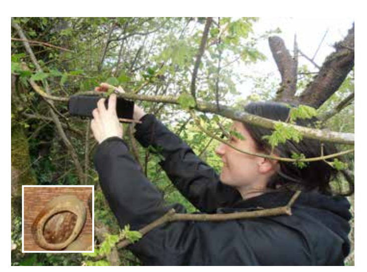
Installing dormouse nesting tubes at Elm Farm. Inset, a dormouse nibbled nut