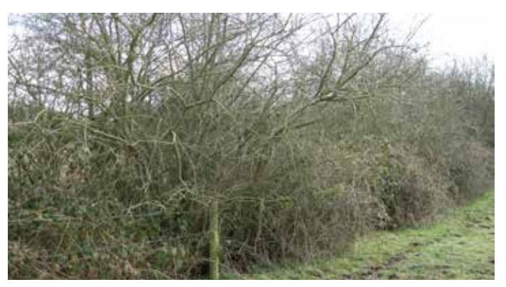
Overgrown hedge where outgrowth needs cutting back before coppicing

To prepare a hedge for coppicing, fence removal and cutting back of outgrowth may be required. Some mechanised coppicing options, for example manual fell with chainsaw or machines with a good reach, such as tree shears or felling grapple with chainsaw bar, may be able to carry out coppicing without needing to remove external fences. However, it is important to remove all wire, such as old fencing, from inside the hedge before coppicing and chipping to ensure machinery is not damaged and the blades blunted. It may also be easier to coppice a hedge once its outgrowth has been cut back.