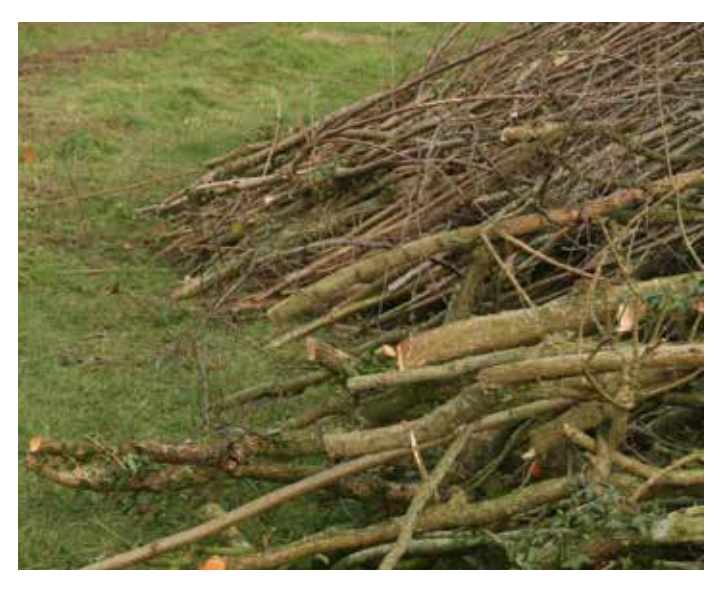
Whole-tree hedgerow material left in field to air dry (above) and green woodchip being tipped in barn to self-dry (below).

TOP TIP Hedgerow woodchip can also be used as gardeners' mulch, path surfacing material, animal bedding or composted and used as a soil improver. Alternatively the hedgerow woodchip could be screened at a larger-scale woodfuel hub to produce a higher quality chip, and the fines composted.