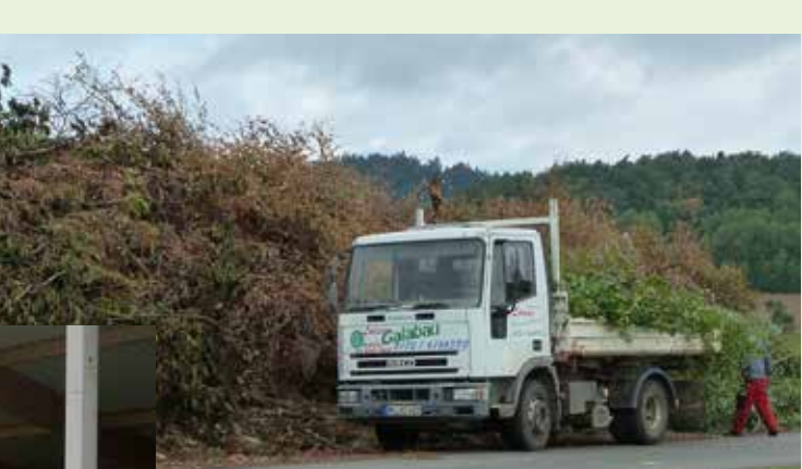
Locally sourced landscape waste being delivered (above), and the processed aboricultural woodchip being stored at the Oberrosphe woodfuel heating plant (below).