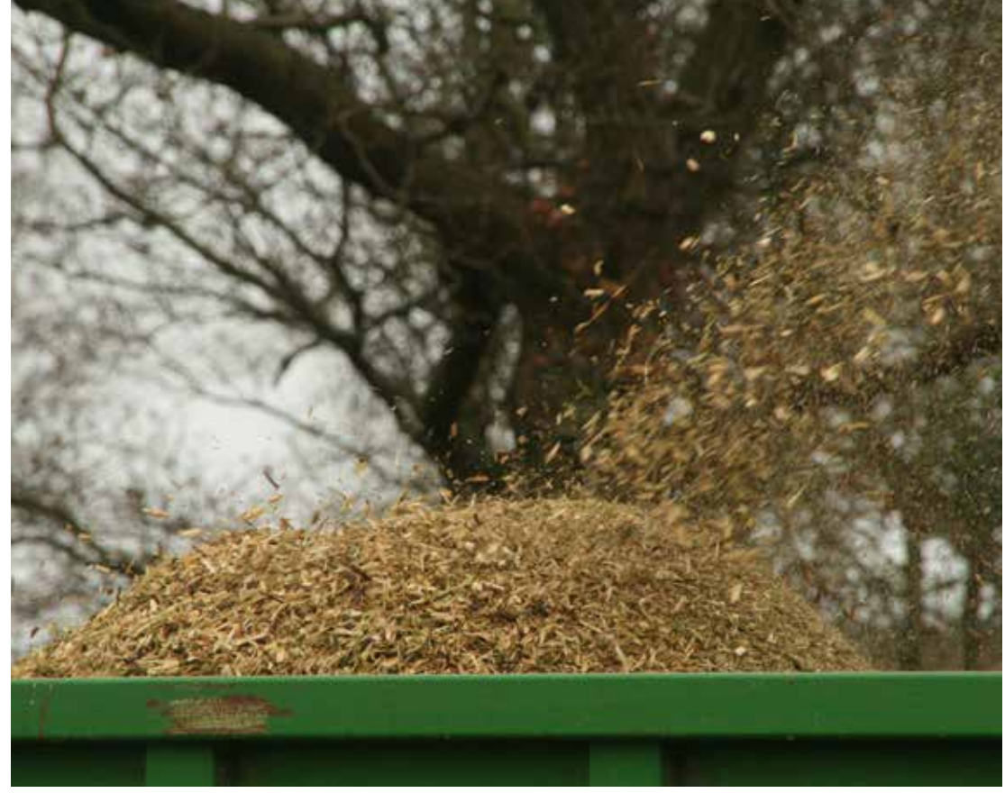
Whole-tree hedgerow woodchip produced from chipping a hazel, blackthorn and field maple hedge at Elm Farm.

Screening your woodchip to remove fines and large slithers could improve its quality and therefore market price; such processing will however increase the cost of production. Screening and drying costs approximately \pounds 1/m^3 and \pounds 2/m^3 of woodchip respectively.<sup>12</sup> Alternatively, some woodfuel hubs will buy hedgerow woodchip discounted by approximately £4/m<sup>3</sup> on the basis they will then have to screen, dry and blend the woodchip before selling it on to their customers.<sup>12</sup>