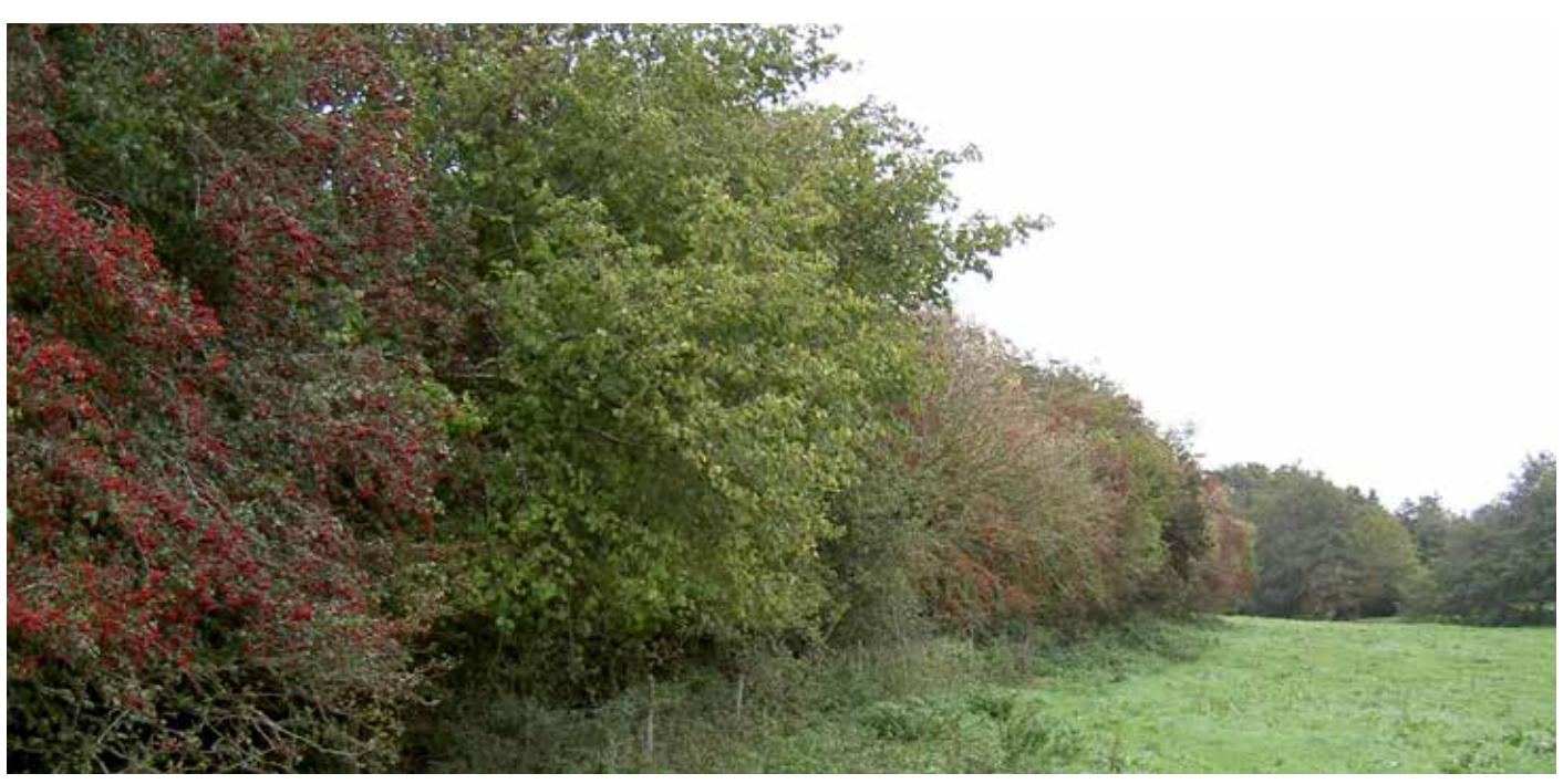
Berry-rich mature hedgerow at Radford Mill Farm, near Bath

Wild birds and certain woodland animals and plants are protected under Part I of this Act. It requires you to carefully assess the impacts of tree work on wildlife, and ensure animals listed in the Act's schedules are not harmed or killed and that their nests or habitat are not damaged or destroyed.