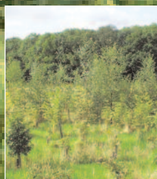
Four years after planting