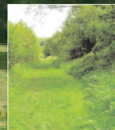
Beautiful in just 12 years