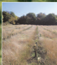
One year later