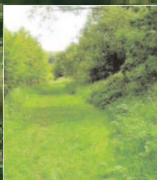
Beautiful in just 12 years