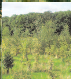
Four years after planting