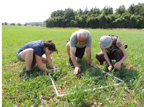
Researchers worked with farmers to assess cover crop species performance

Presenting experimental data in a format that encourages uptake remains a key part of ORC's work. The OSCAR toolbox enabled farmers to identify suitable subsidiary crop species, varieties and appropriate species mixtures and access practical management advice. The online toolbox is now available via the Subsidiary Crop Database , which is part of the AgroDiversity Toolbox wiki site .