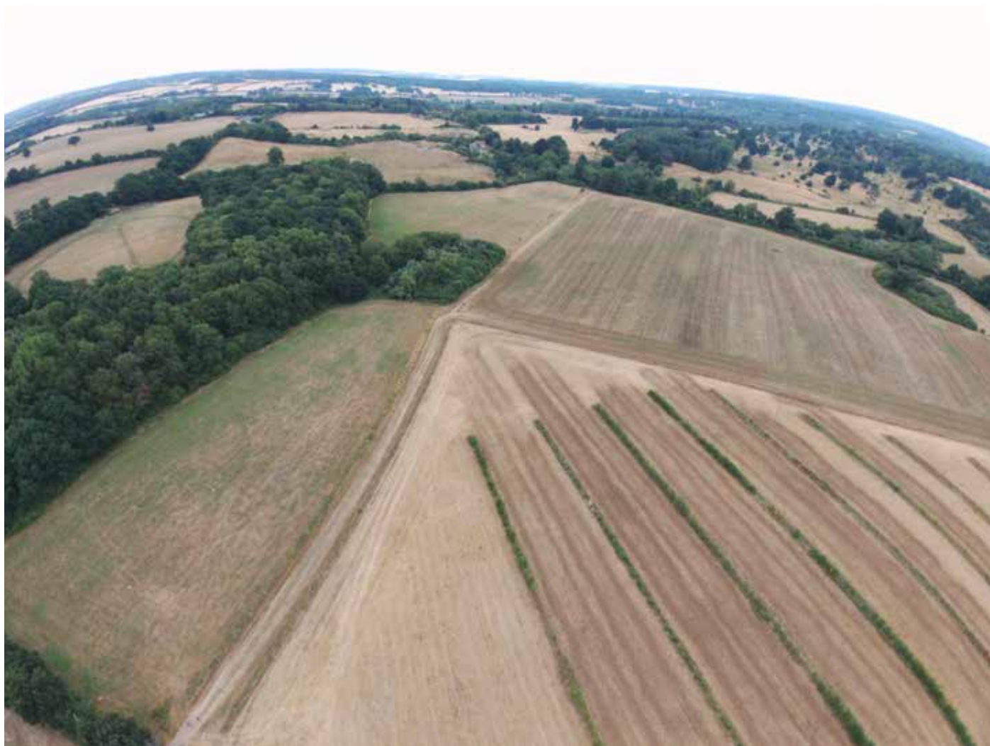
Figure 5. Aerial view of Elm Farm in late summer 2018 showing the integrated SRC bioenergy and livestock alley cropping system.

The new tree planting and agroforestry alley cropping systems were planned around the existing trees and hedges, to fit with the agricultural system and management constraints, test novel planting designs and sought to use underrepresented species as well as those that were known to be suited to the Farm. The aims were to increase the diversity of trees and hedges on the farm both in terms of species but also in terms of tree growth stages and to investigate how trees could increase the resilience of the farming system via the environmental services and resources (e.g. fuel or fodder) provided.