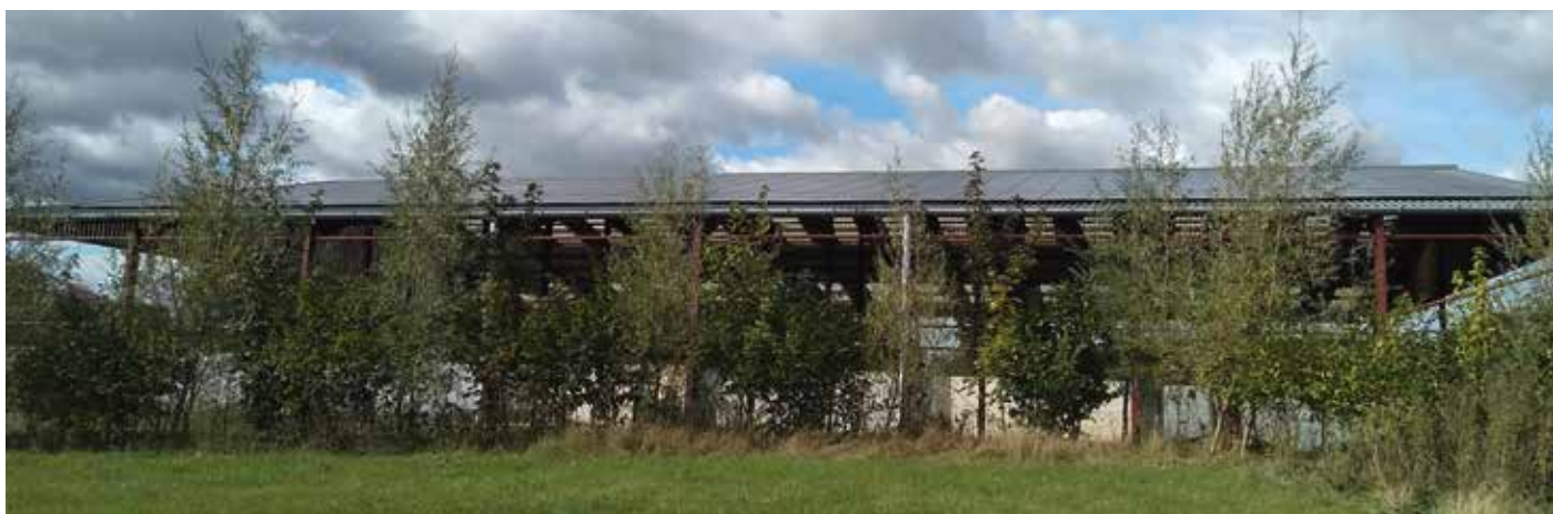
Figure 8: New bioenergy hedges at Elm Farm.