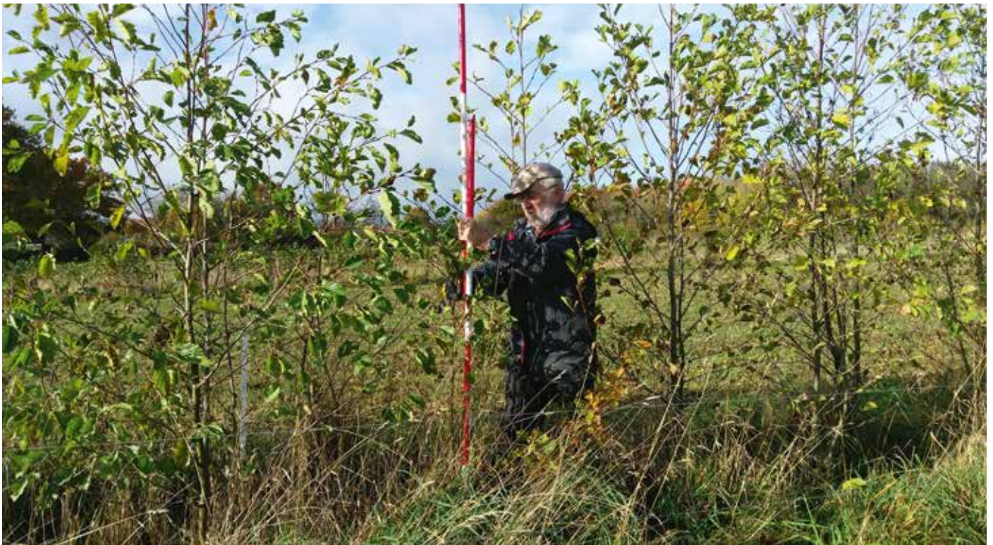
Figure 11: Harvesting and measuring SRC from the integrated bioenergy and livestock agroforestry trial