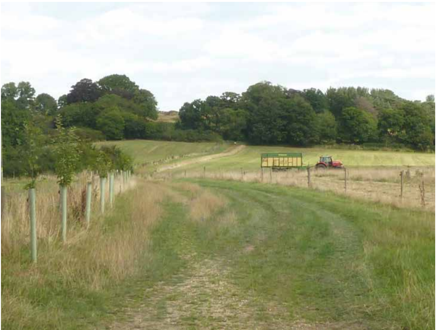
Figure 6: Multi species tree avenue.