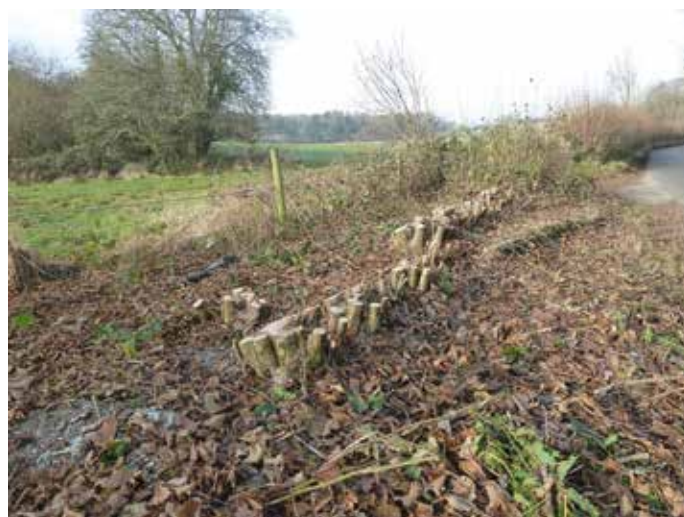
Newly coppiced hedge Elm Farm

Stools were protected by the existing livestock fencing but browsing damage on the coppice regrowth was low with a notable preference for hawthorn from the local deer population.