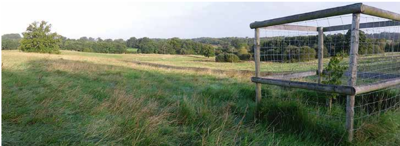
Figure 7: In field trees at Elm Farm in stockades.