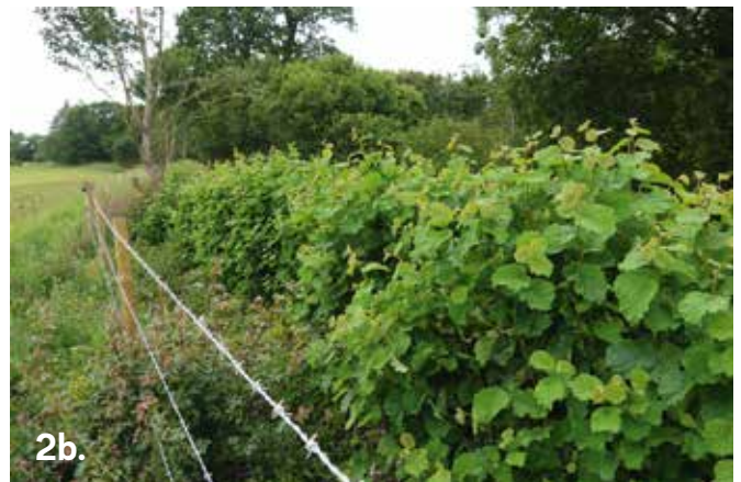
Figure 2. Managing hedge for bioenergy production (a) coppicing a hazel hedge at Elm Farm in 2015 (b) hazel coppice regrowth after six months