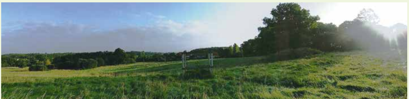
Figure 1: Panorama of Elm Farm showing the existing hedgerows and newly planted in-field trees.