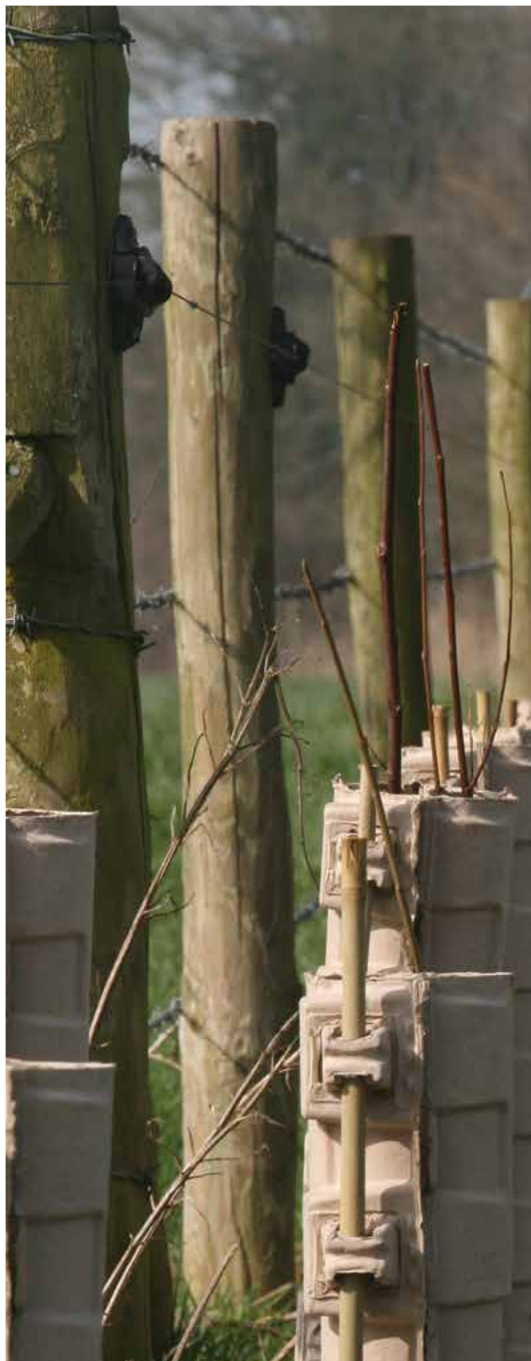
Figure 9: New hedge planting at Elm Farm using biodegradable moulded fibre guards tree guards and standard spiral guards.

The biggest challenge with the in-field trees was providing adequate protection against livestock. The stockades were expensive but effective, and to date, have needed no maintenance. However, they restrict access for management and in some cases, have been colonised by weeds. The stockades also make tractor manoeuvres around the trees for hay or silage cuts more challenging.