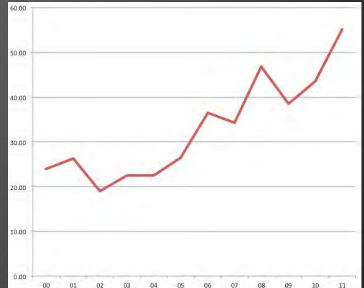
Heating oil costs adjusted for RPI 2000- 2011

Need for capital and a reliable supply of genuinely sustainable woodfuel