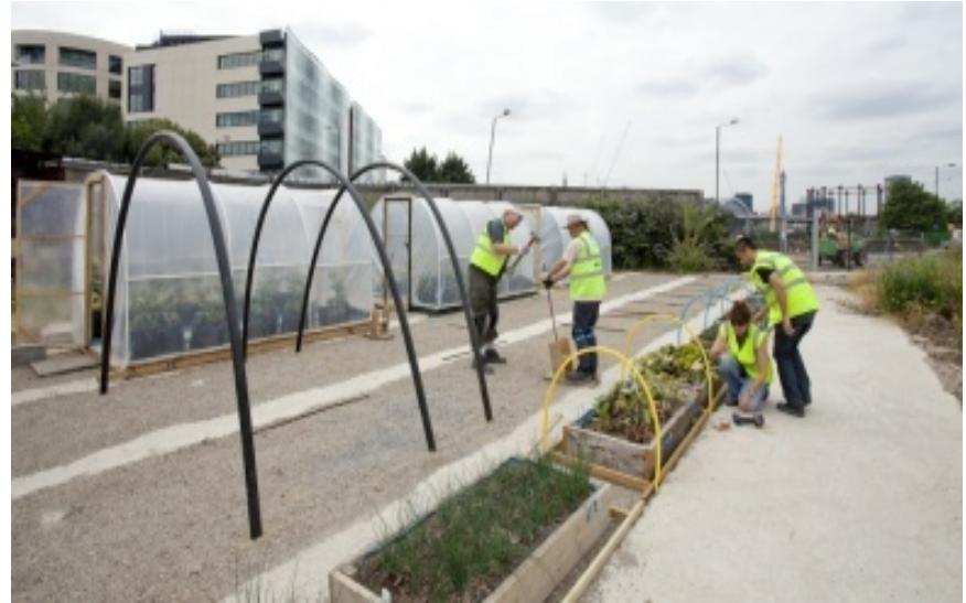
The Skip Garden, Global Generation, London